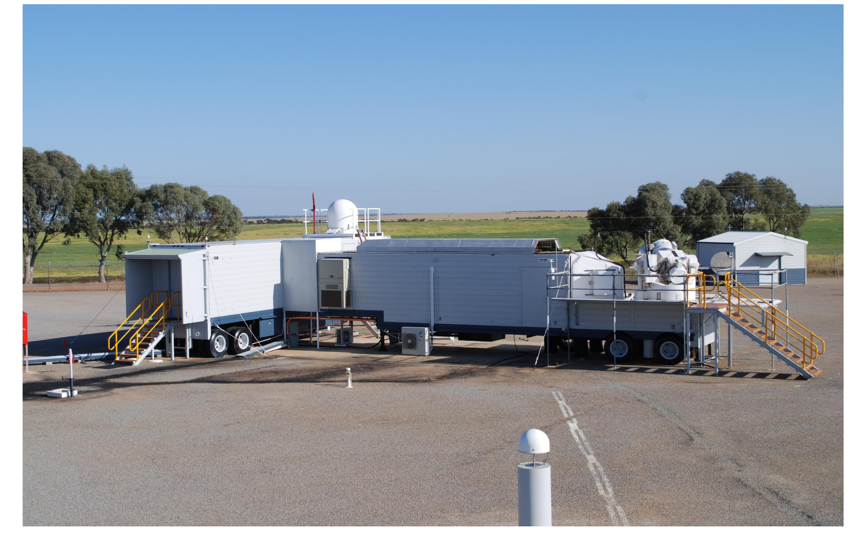
Figure # 4 The new safety rated access steps into the Instrument van (left) and mount area (right).