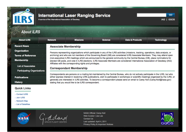
Figure 4. Design for Level 2 Page within the About ILRS Section

Level 2, 3, etc. pages use a two-column layout that consists of left column and a main content section. The left column contains a navigation area and a list of "quick links" which are links to popular pages within the current section of the website. The second column contains the main text for the page. An example level 2 page within the About ILRS section of the website is shown in Figure 4.