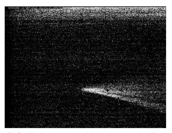
Fig.5. 200 times exposure modulation, exposure time 67 \ \mu \ s