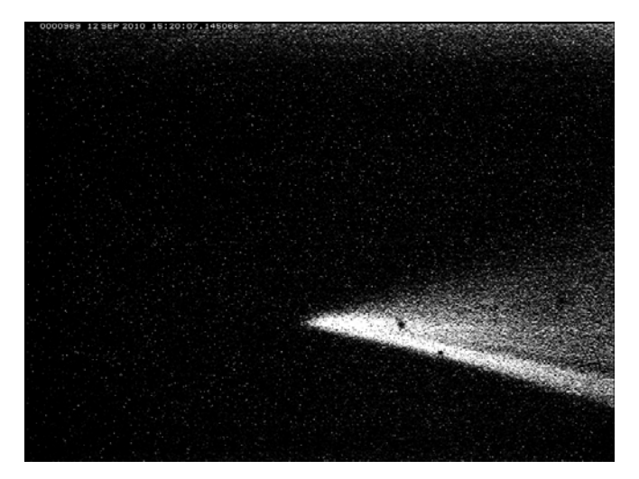
Fig.6. 1000 times exposure modulation, exposure time 67.5\,\mu s