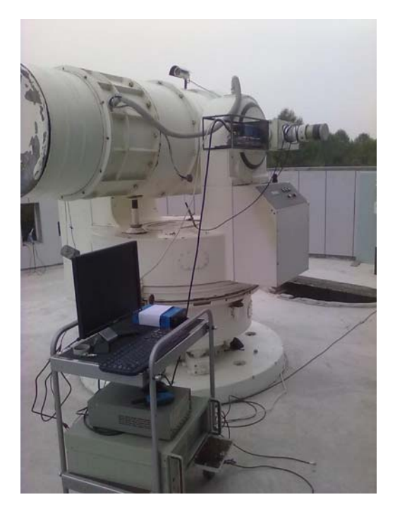
Fig.2. Photograph of experiment equipment