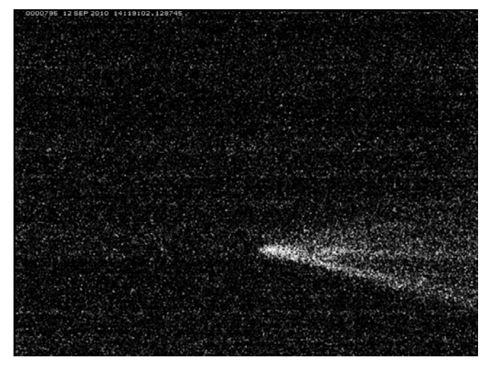
Fig.4. 100 times exposure modulation, exposure time 50 µ s

Figures underneath are the representative result we got.